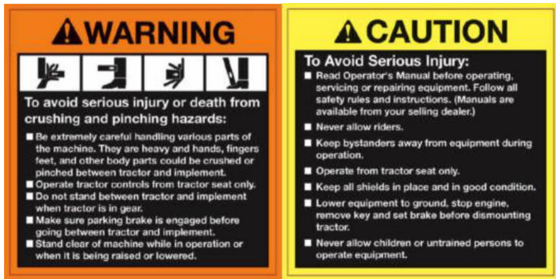
Qty 1 – Crush/Pinch Warning Decal