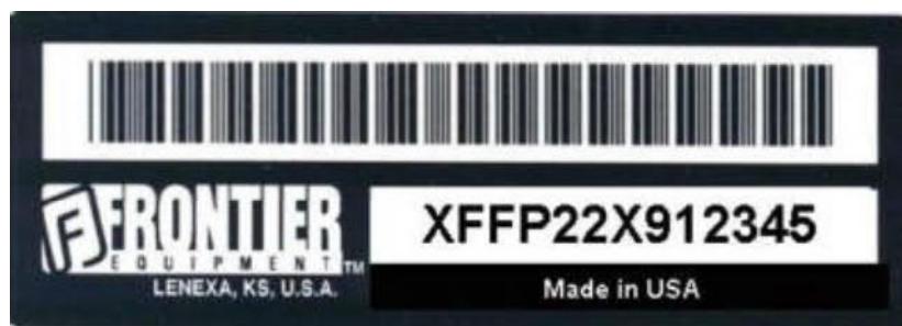
Qty 1 – Serial Number Decal

Replace decals immediately if damaged or worn.