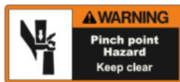
Qty 2 – Pinch Point Warning Decal