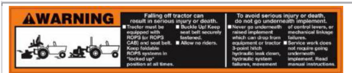
Qty 1 – Falling Off Warning Decal