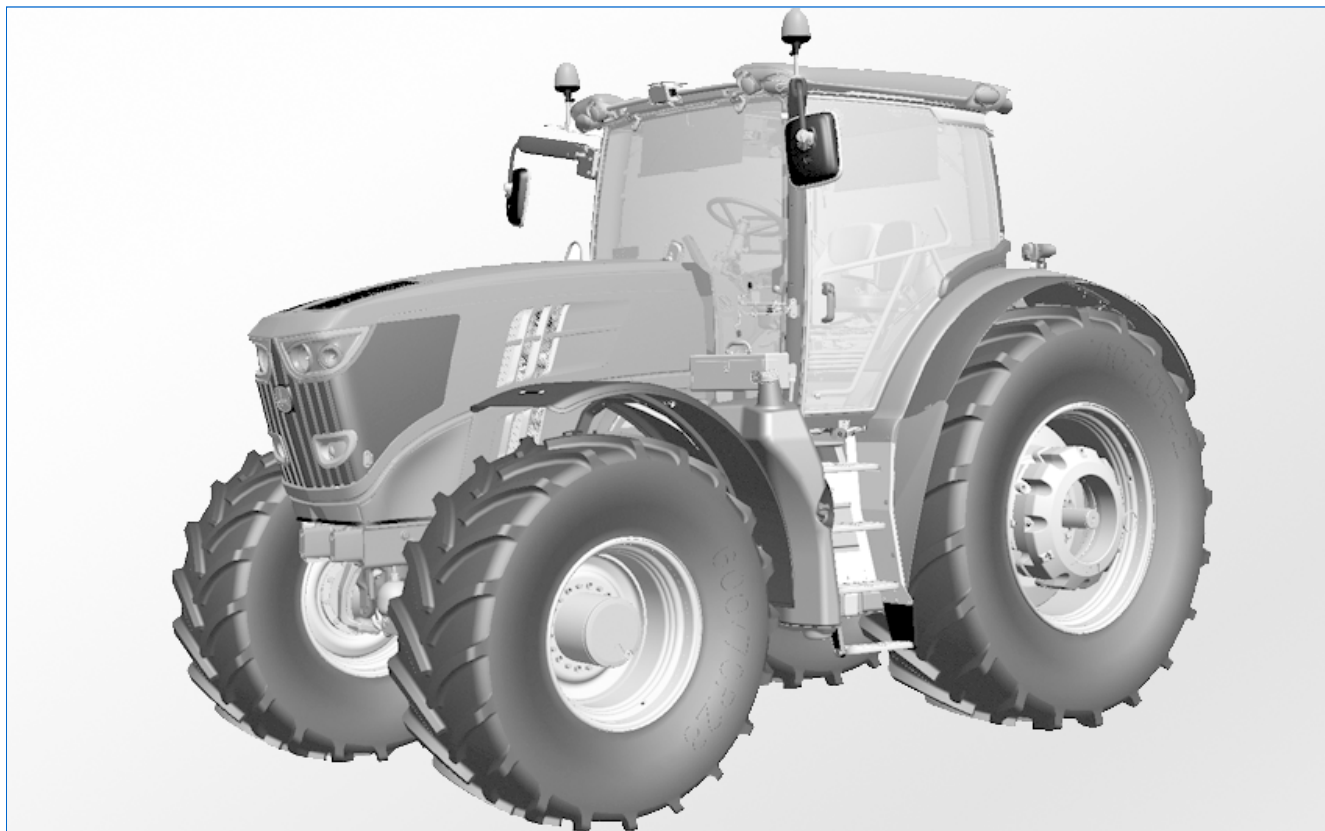
LX203985-UN: Tractor Shown with Additional Equipment