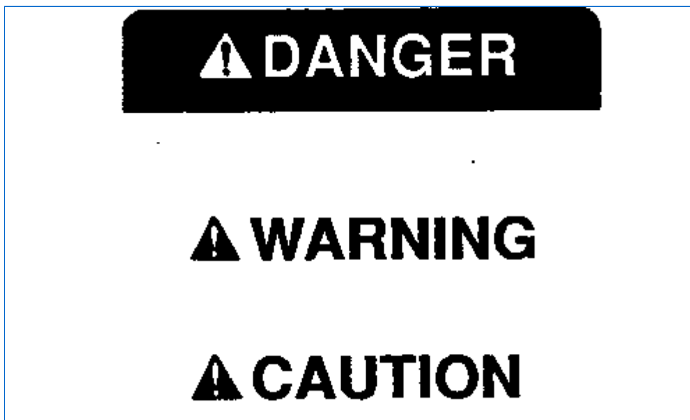
TS187-19: Signal Words

A signal word—DANGER, WARNING, or CAUTION—is used with the safety-alert symbol. DANGER identifies the most serious hazards.