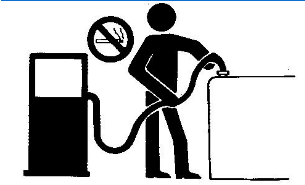
TS202-UN: Avoid Fires

Handle fuel with care: it is highly flammable. Do not refuel the machine while smoking or when near open flame or sparks.