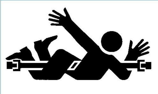
TS1644-UN: Rotating Drivelines