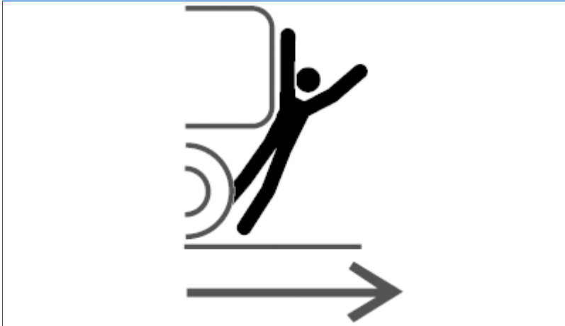
PC10857XW-UN: Avoid Backover Accidents

Before moving machine, be sure that all persons are clear of machine path. Turn around and look directly for best visibility. Use a signal person when backing if view is obstructed or when in close quarters.