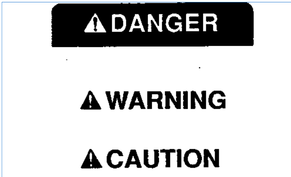
TS187-19: Signal Words

A signal word—DANGER, WARNING, or CAUTION—is used with the safety-alert symbol. DANGER identifies the most serious hazards.