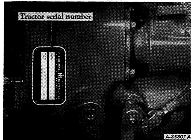
Illust. 3A Location of the tractor serial number.

When in need of parts, always specify the tractor and engine serial numbers, including any prefix or suffix letters. On the Farmall 460 Tractor the tractor serial number is stamped on a plate attached to the right side of the clutch housing. On the Farmall and International 560 Tractors the serial number is on a plate attached to the left side of the clutch housing. See Illust. 3A .