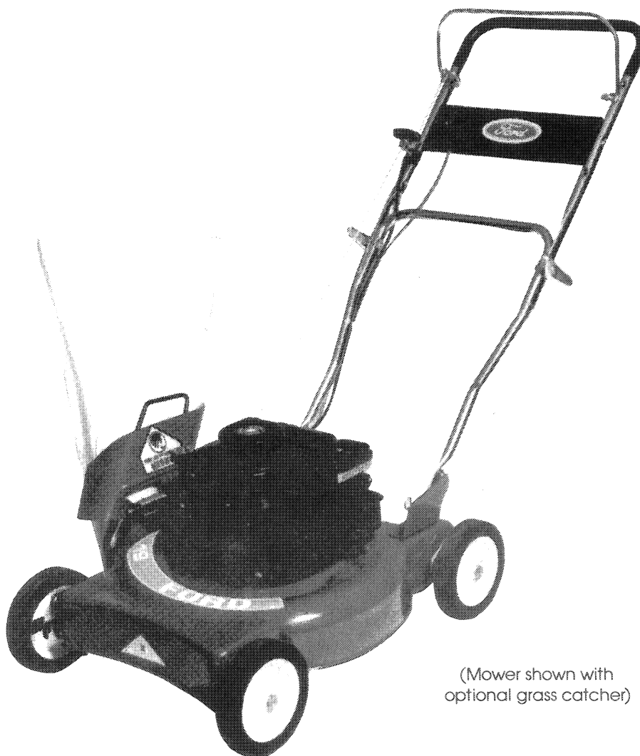
(Mower shown with optional grass catcher)

The manufacturer reserves the right to make changes on and to add improvements upon its product at any time without notice or obligation. The manufacturer also reserves the right to discontinue manufacture of any product at its discretion at any time.