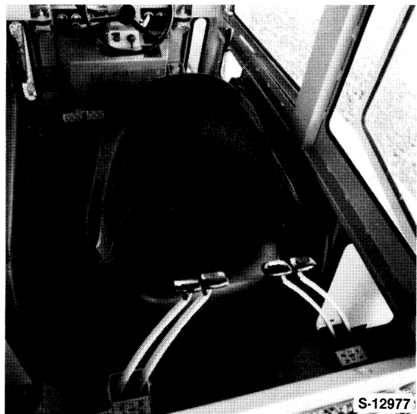
Figure 3 Operator's Seat—Backhoe Position