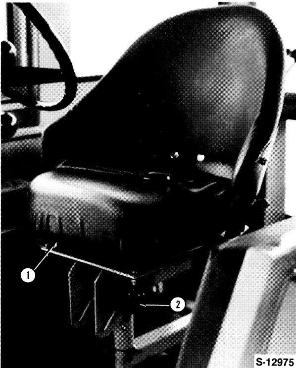
Figure 1 Operator's Seat

Your new Ford 755A is equipped with a "turnabout" type seat, Figure 1. It can be adjusted forward or rearward a maximum of seven inches (17.8 cm) by moving the seat release lever. The height can also be changed two inches (5.0 cm) to suit the operator by loosening the height adjustment knob.