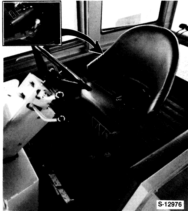
Figure 2 Operator's Seat—Traveling and Loader Position 1. Swing Around Seat Release Lever

Once the seat is adjusted for operator comfort, in the loader operating position, it can be turned to the backhoe position by releasing the seat release lever. See Figures 2 and 3. Once the seat is adjusted for loader operation it will usually suit the operator for backhoe operation without additional adjustments.