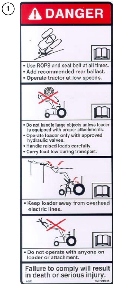
Danger Decal Part No.: 86979960 Location: Right side, rear of mount upright