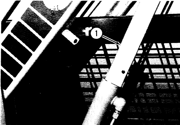
1. Lift Cylinder Support Strut