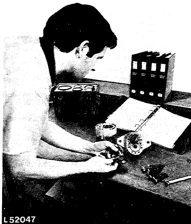
Use Technical Manuals for Actual Service

When a serviceman should refer to a FOS Manual for more information, a FOS symbol like the one at the left is used in the TM to identify the reference.