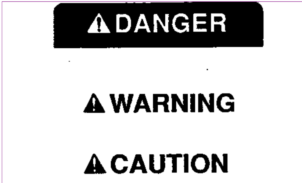
TS187-19: Signal Words

A signal word—DANGER, WARNING, or CAUTION—is used with the safety-alert symbol. DANGER identifies the most serious hazards.