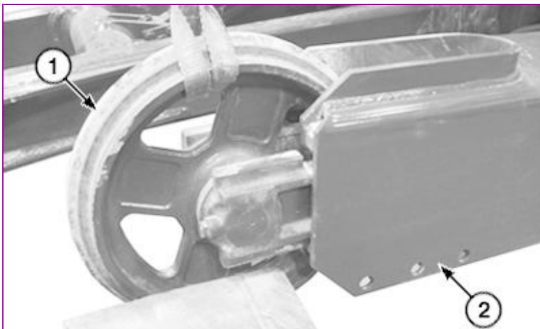
TX1132778A-UN: Front Idler

Prevent possible crushing injury from heavy component. Use appropriate lifting device.