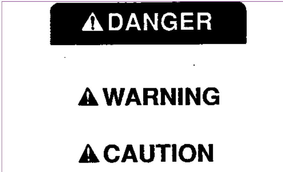
TS187-19: Signal Words

A signal word—DANGER, WARNING, or CAUTION—is used with the safety-alert symbol. DANGER identifies the most serious hazards.