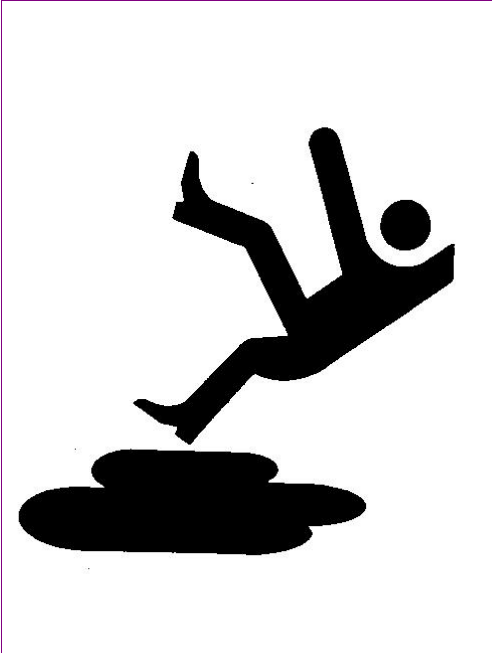
TS218-UN: Keep Area Clean

Understand service procedure before doing work. Keep area clean and dry.