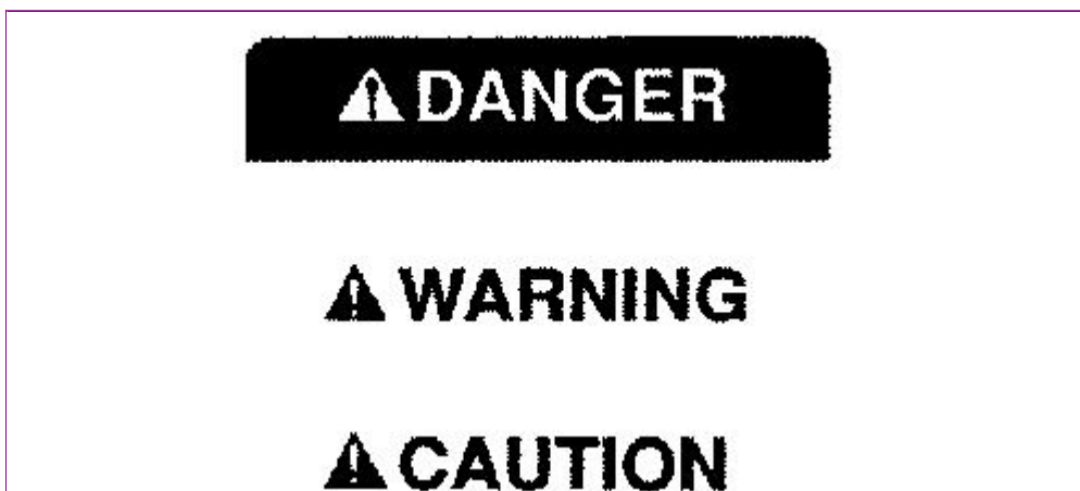
T133588-19: Safety Alert Symbols

This is the safety alert symbol. When you see this symbol on your machine or in this manual, be alert for the potential of personal injury.