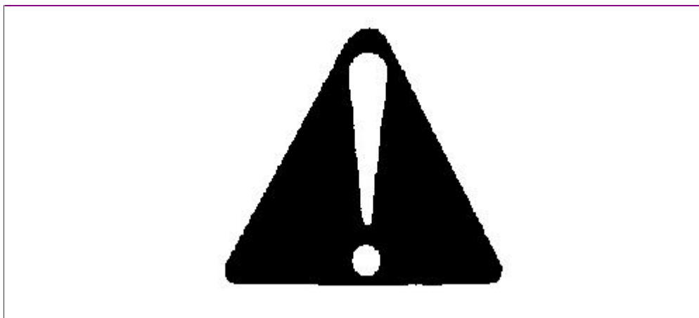
T133555-UN: Safety Alert Symbols