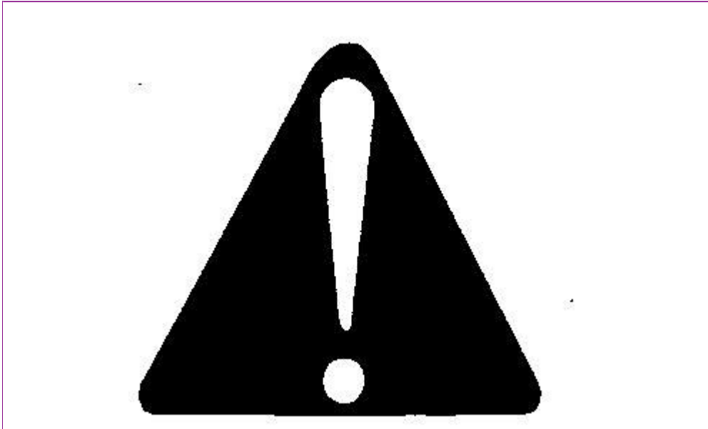
T81389-UN: Safety-alert symbol

This is a safety-alert symbol. When you see this symbol on your machine or in this manual, be alert to the potential for personal injury.