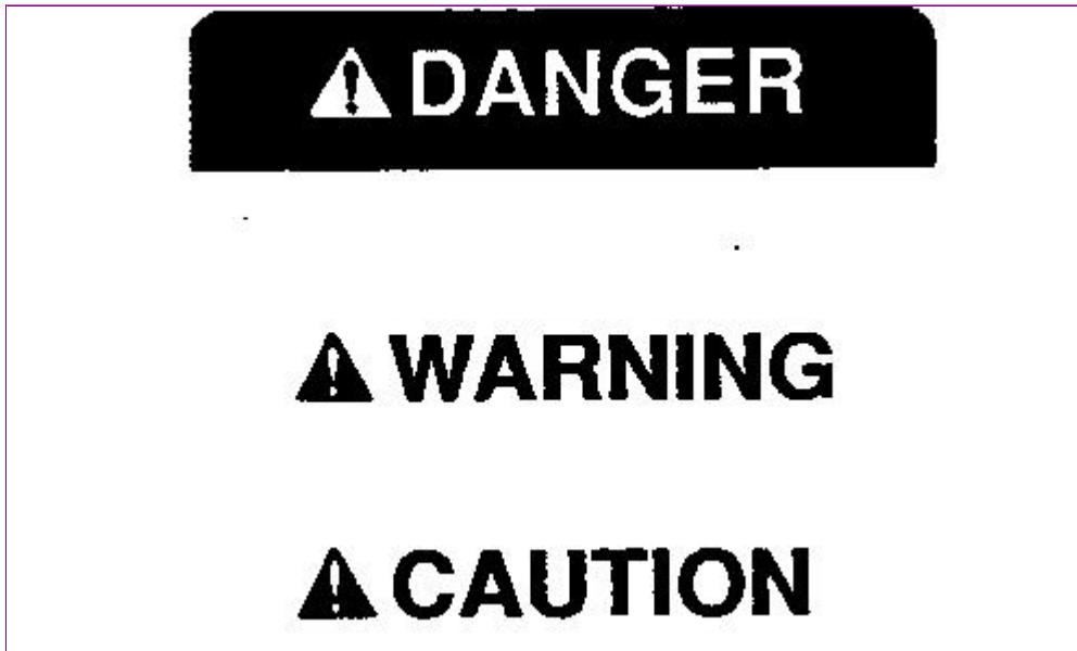
TS187-19: Signal Words

A signal word—DANGER, WARNING, or CAUTION—is used with the safety-alert symbol. DANGER identifies the most serious hazards.