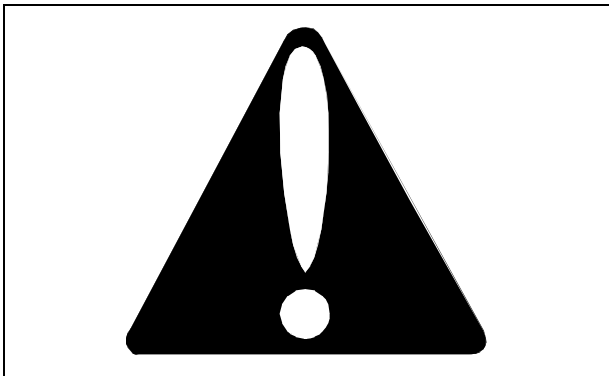
Safety Alert Symbol

The machine safety labels shown in this section are placed in important areas on your machine to draw attention to potential safety hazards.