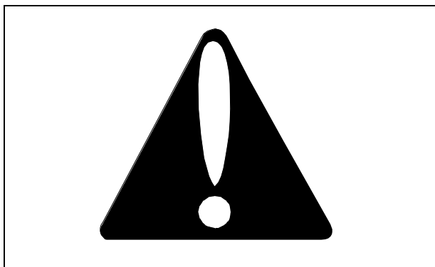
SAFETY ALERT SYMBOL

The machine safety labels shown in this section are placed in important areas on your machine to draw attention to potential safety hazards.