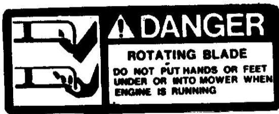
Left End of Mower Deck