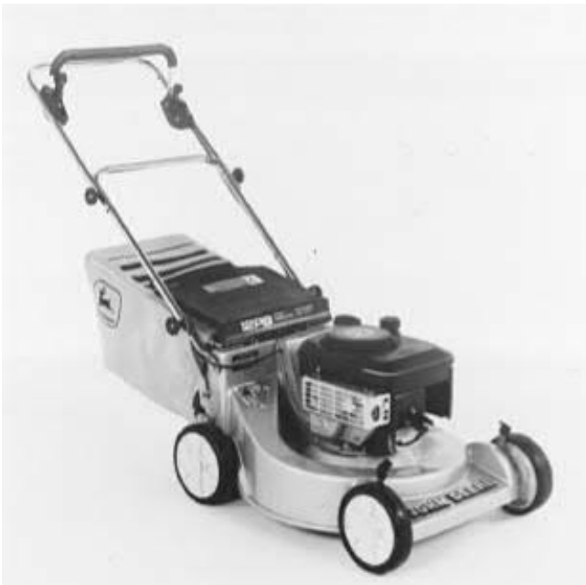
Model 12PB, 2-Cycle Engine

This warranty provides you the assurance that John Deere will back its products where defects appear within the warranty period. In some circumstances, John Deere also provides field improvements, often without charge to the customer, even if the product is out of warranty. Should the equipment be abused, or modified to change its performance beyond the original factory specifications, the warranty will become void and field improvements may be denied. Setting fuel delivery above specifications or otherwise overpowering machines will result in such action.