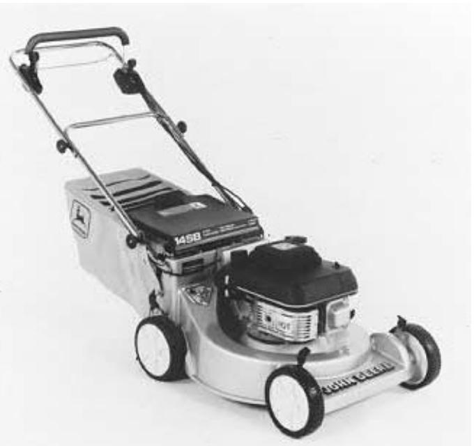
Model 14SB, 4-Cycle Engine