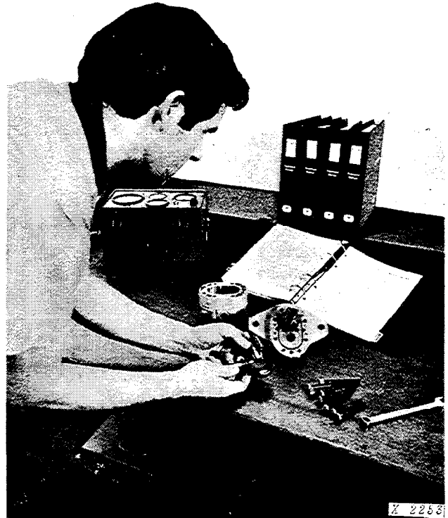
Use Technical Manuals for Actual Service

This technical manual is part of a twin concept of service: