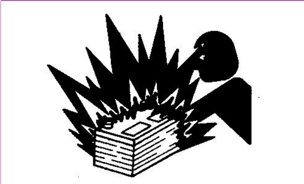
TS204-UN: Battery Explosions

Keep sparks, lighted matches, and open flame away from the top of battery. Battery gas can explode.