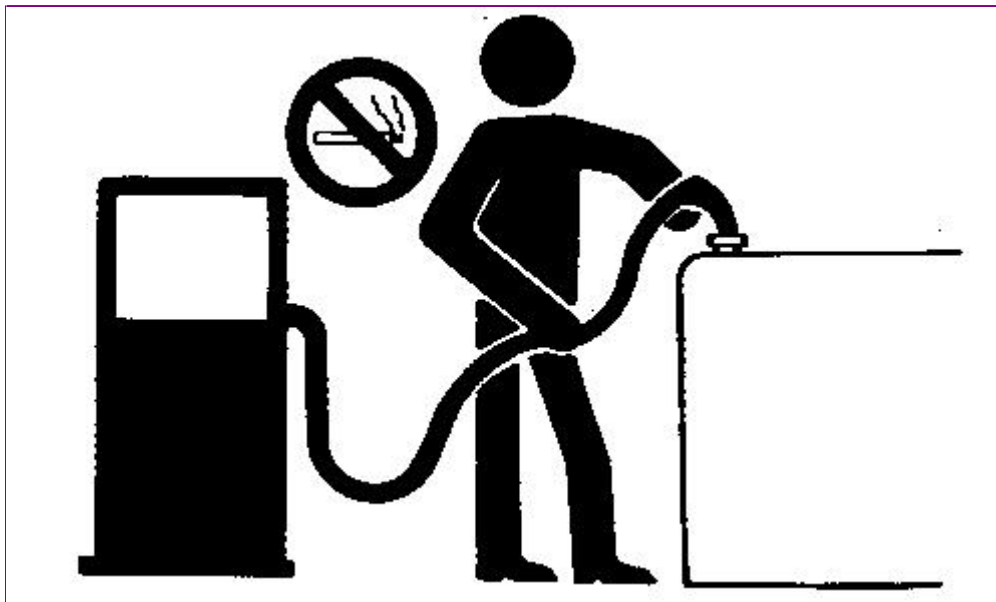
TS202-UN: Handle Fuel Safely—Avoid Fires

Handle fuel with care; it is highly flammable. Do not refuel the machine while smoking or when near open flame or sparks. Always stop engine before refueling machine. Fill fuel tank outdoors.